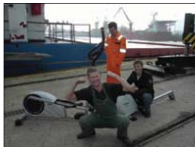
Crew members of the Wilson Trent with the equipment at the dockside.